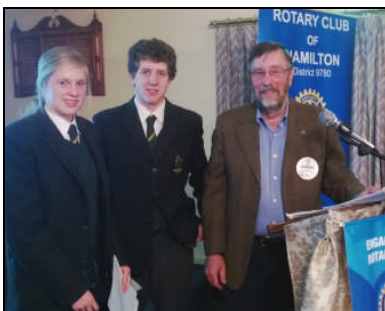
Defying the Drift