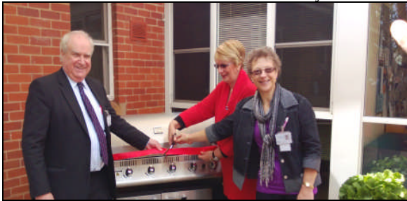
BBQ donated to WDHS ADASS