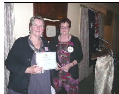
WDHS community transport service