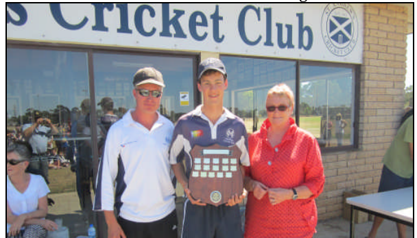
Presentation of Junior Cricket trophy