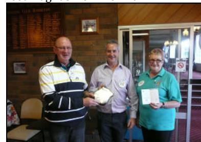
Annual Bowls March with RC Hamilton North