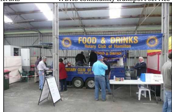
Outdoor Expo at Showgrounds