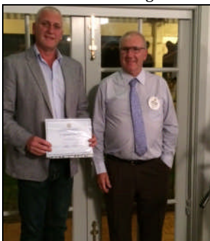
Gilly's new passion