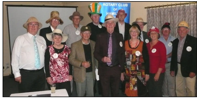
Celebrating Hat Day