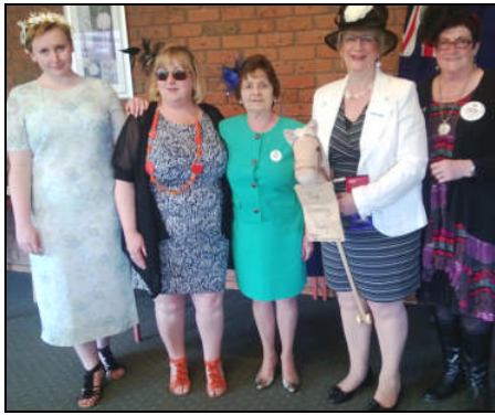
Melbourne Cup fashions