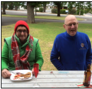
Welcome to Summer??