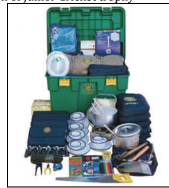
Contents of Shelterbox