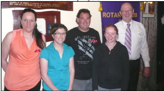
Visit by Rotaractors