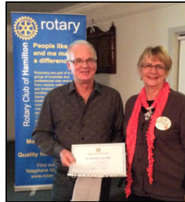
History of HIRL