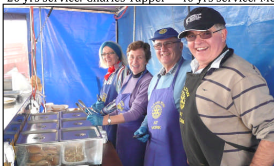
Sheepvention – preparation and service