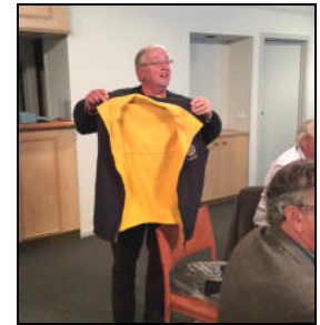
What am I bid?