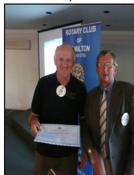
Solomon Islands project