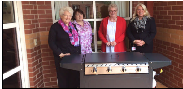
BBQ donated to Birches Auxiliary