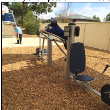
Special Development School playground