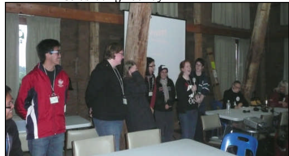
Combined Meeting at HIRL