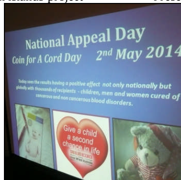
Inner Wheel - Cord Blood Day