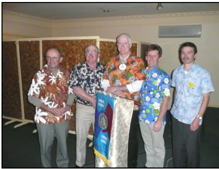
Return of the Fiji Flyers